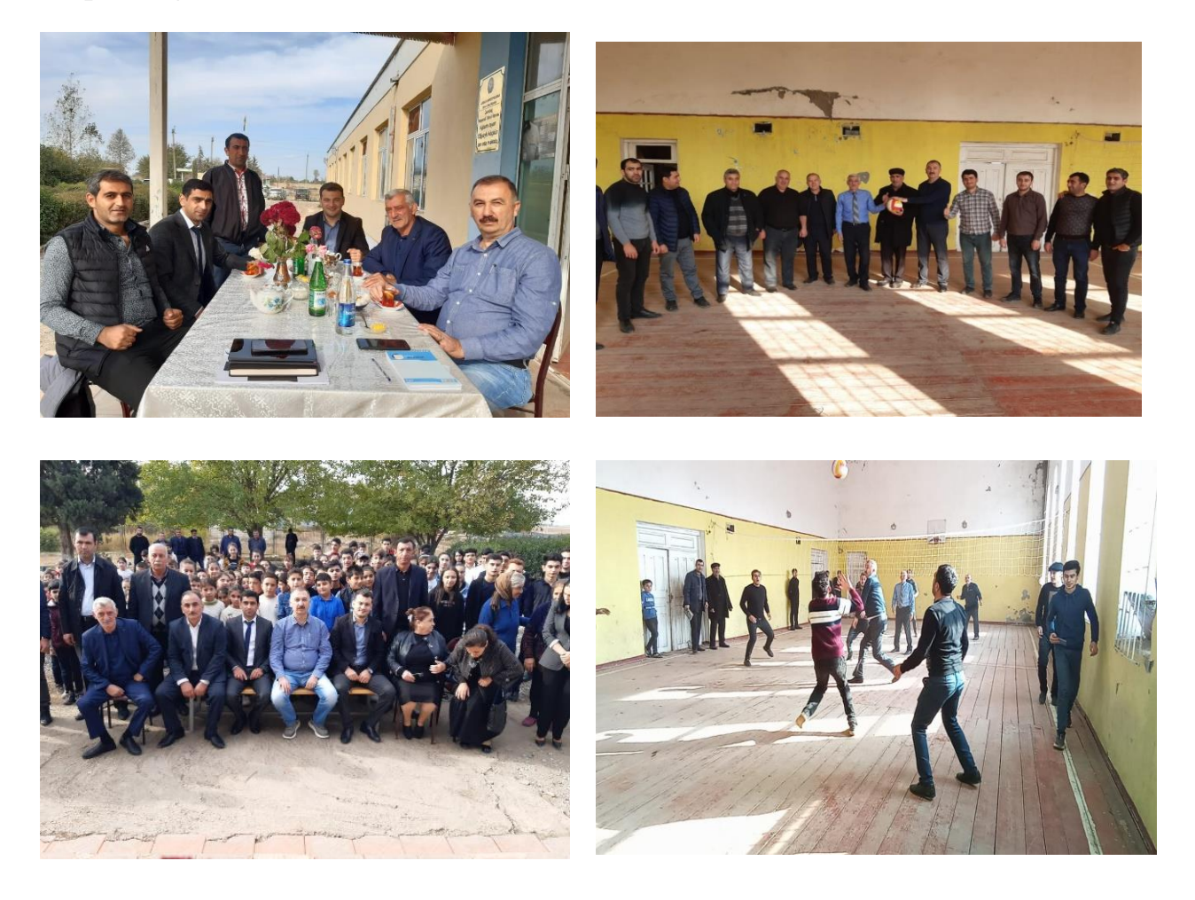
IEPF 1 - Ergi 1 Friendship won.

During meetings in Ergi town of Aghdam, residents welcomed us trainers as their dearest people. After the training, we continued our discussions over tea. During the meetings, as a IEPF family, we decided to donate balls suitable for sports to schools in order to develop sports in displaced settlements. When we presented a ball to the Ergi school, a wonderful proposal came from the teachers. The proposal was to use this ball for the first time by holding a volleyball competition between IEPF trainers and the staff of Ergi school. The proposal was accepted and we held a special game.